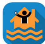
Floods Near Me